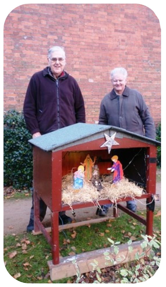
December 2023 KSC Nativity Crib outside Holy Trinity Church, Guildford